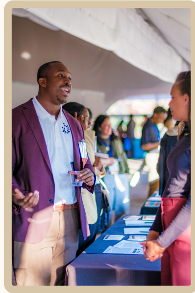
“Saturday Evening Networking”