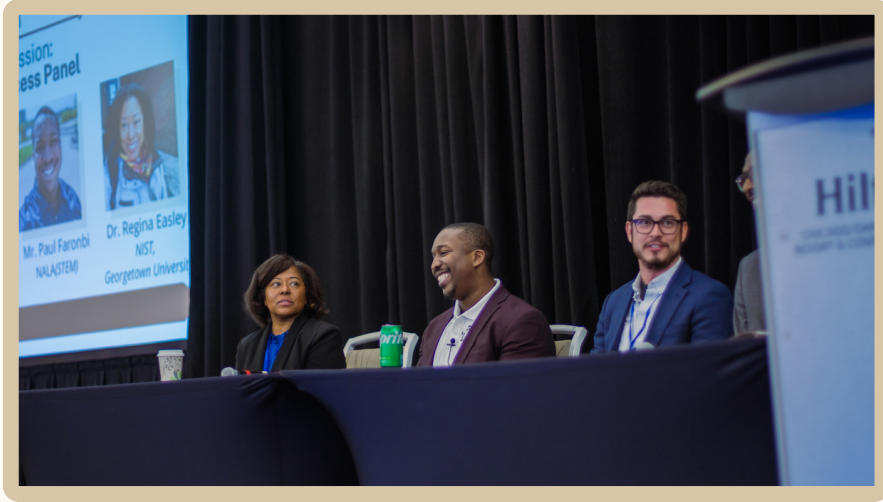
“Voices of Success Panel”