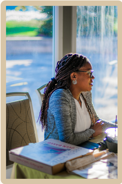
General Session – “Transform Your Life, Transform Your World”